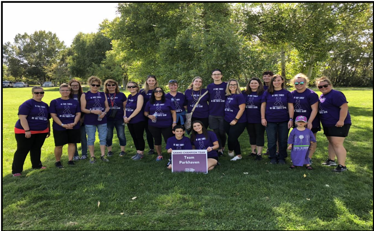
2018 Team Parkhaven

There's no clear line that separates normal changes from warning signs. It is always a good idea to check with a doctor if you or a loved ones abilities seem to be declining.