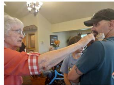
A visit with Mushu the Bearded Dragon